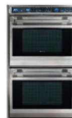
Model DO30F/S Framed Door Style

Accessories are available through your authorized Wolf dealer. For local dealer information, visit the find a showroom section of our website, wolfappliance.com .