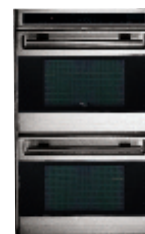
Model DO30U/S Unframed Door Style