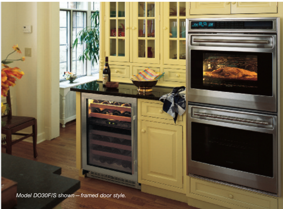
Model DO30F/S shown—framed door style.

Electronic controls hide behind a stainless steel panel. A motor quietly rotates the control panel into position. Both ovens of the Wolf L series built-in double oven feature the Wolf dual convection system. It delivers even temperature and airflow throughout the oven. Two fans and four heating elements operate either simultaneously or in sequence, depending on which one of the ten different cooking modes you choose.