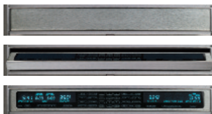
Rotating glass touch control panel.

This appliance is certified by Star-K to meet strict religious regulations in conjunction with specific instructions found on www.star-k.org .